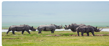
Ngorongoro Conservation Area